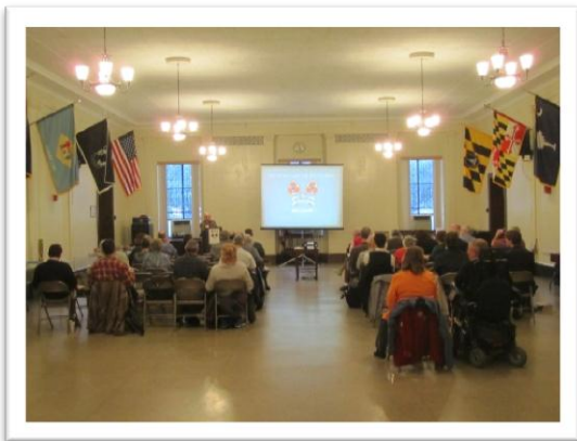
Opening of the Fall 2011 Seminar on 29 October

Although the weather accompanying WFA East Coast fall seminars has been typically mild and clear over the years, Saturday 29 October was anything but “picture perfect” offering instead an unseasonably early winter mix of driving rain, sleet and wet snow throughout the day. Despite what was described by several attendees as the worst seminar weather they could recall, some 54 persons turned out for the day-long program of WWI history presentations and displays at the Maryland War Memorial Building in Baltimore. The event had been on track for a near-record attendance of 75 to 80 persons before poor weather altered travel plans for many.