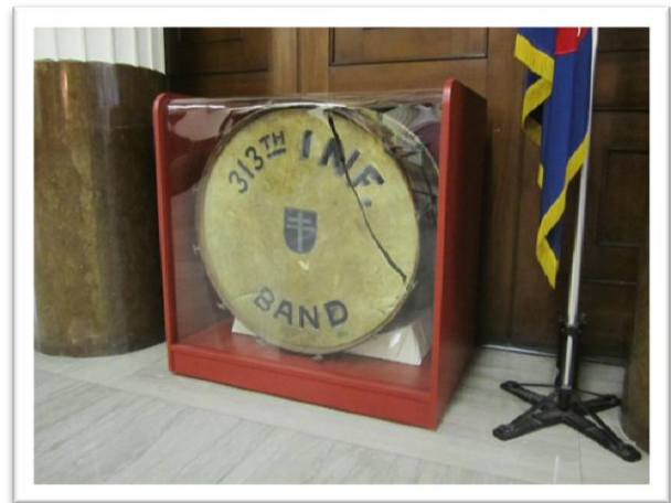
313 th Infantry band bass drum now displayed in its custom-fabricated case at the Maryland War Memorial Building. Thanks to the building staff for furnishing the appropriate 313 th regimental color adjacent to the case.

The drum itself received a gentle cleaning via soft bristle brush to remove accumulated dust and dirt before being placed in the case. Special thanks goes to the Baltimore-based Dorfman Museum Figures for the donation of materials used to construct an inert polyethylene foam cradle for the drum within its case.